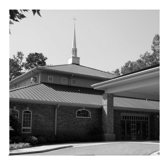
February 13, 2022