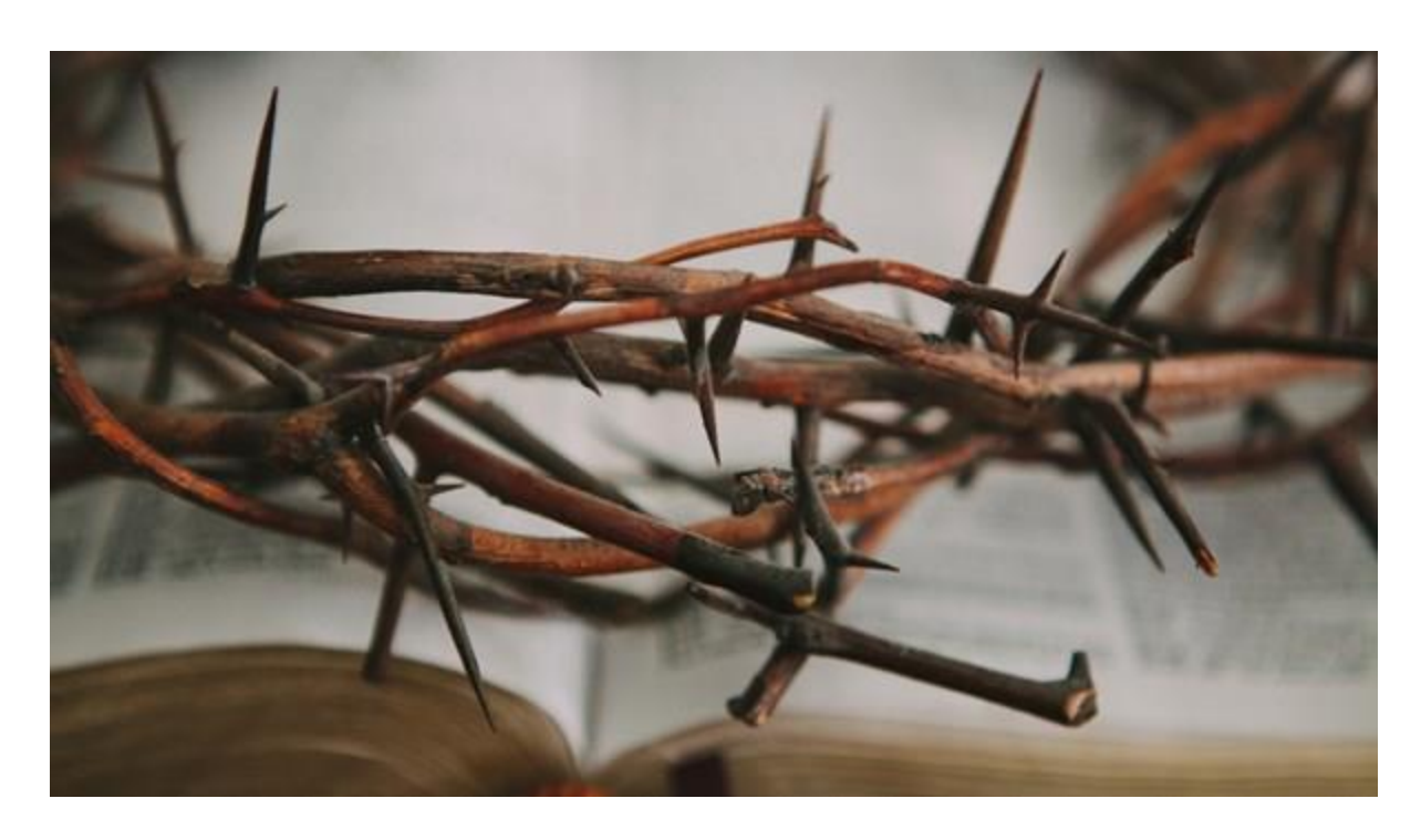
April 2, 2021