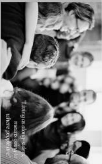
"Living as along, sisters means going to where people are."

"New starts reach more new people for Christ."