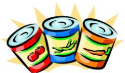
Non-perishable canned veggies & pasta

We will be collecting the following goods (there are bins both inside & outside for collection):